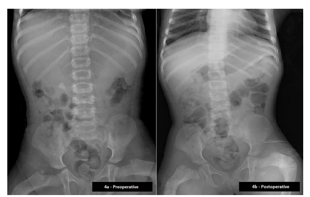
Figure 4a and 4b. Preoperative (4a) and Postoperative Third Month (4b) X-ray Image